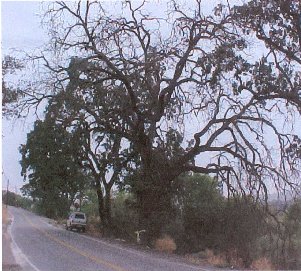
SUBJECT TREE 34 " DIA, VALLEY OAK SOUTH RIVER ROAD, PASO ROBLES CALIFORNIA